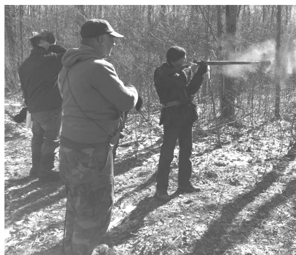
Primitive Snowshoe Biathlon — There may not have been enough snow for snowshoes, but there was plenty of fun to be had at the Biathlon.