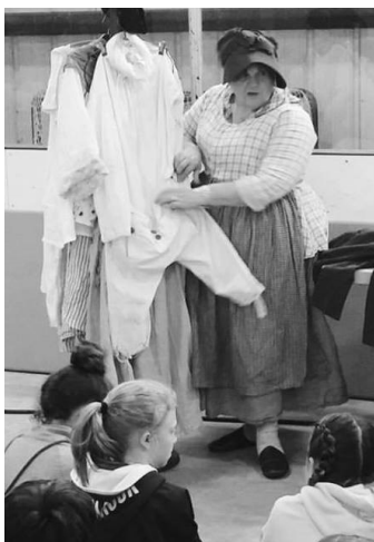
Living History Day