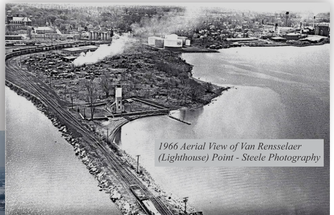
1966 Aerial View of Van Rensselaer (Lighthouse) Point