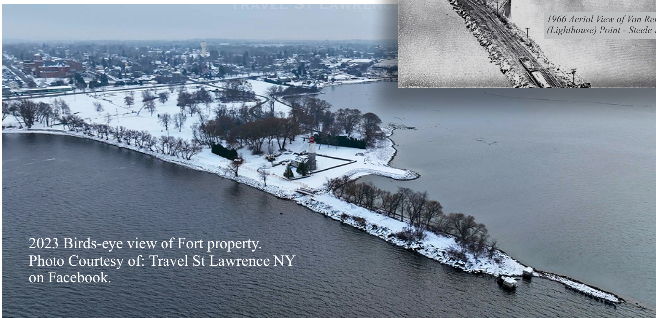
2023 Birds-eye view of Fort property.